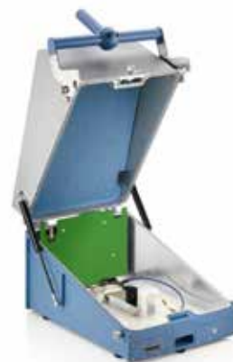
R&S®CMW-Z10 RF Shield Box